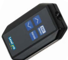
IR Remote Controller RIS-15